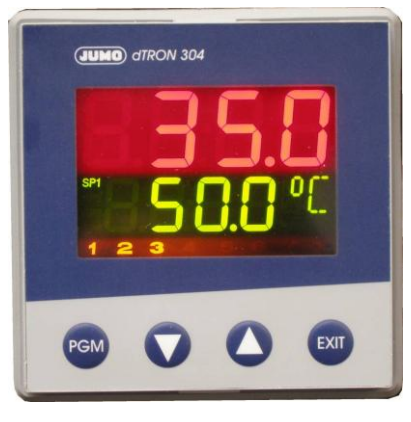
Figure 1 Jumo controller