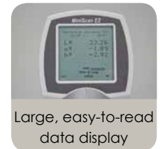
Large, easy-to-read data display