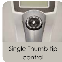
Single Thumb-tip control